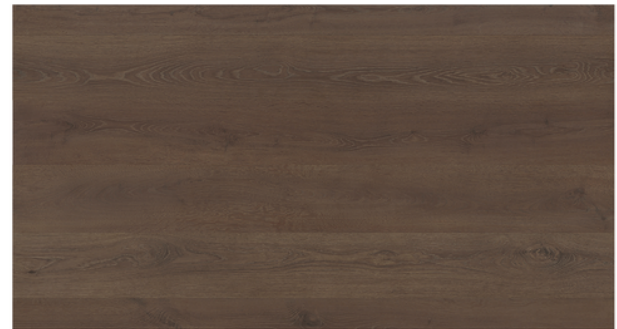
True Tulip 941111