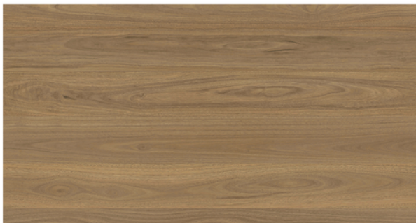
Atlantic Spotted Gum 941114