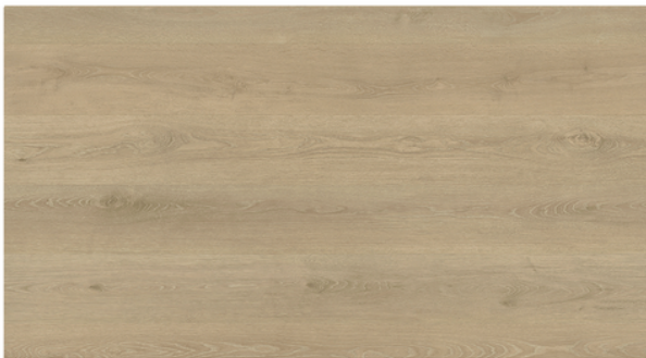
Zebra Ark 941110