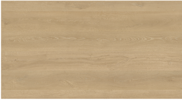
Sunrise Tellin 941108