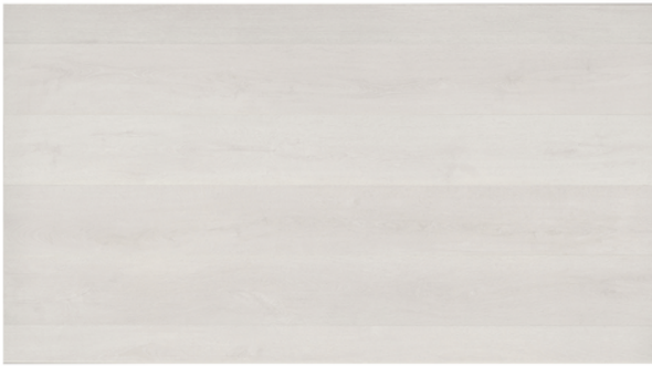
Tiger Lucine 941101