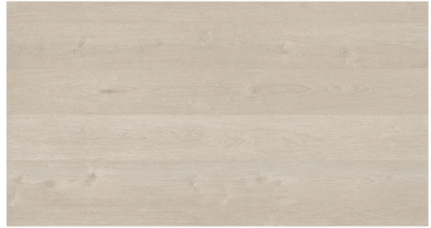
King Helmet 941102