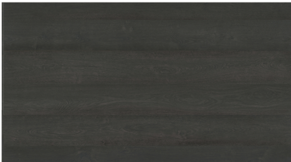
Black Mussel 941112