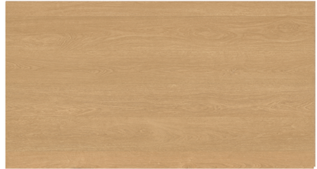
Crown Cone 941109