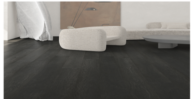
Black Mussel 941112

Images are an indication of colour only. Variations in colour & appearance are to be expected between images & samples.