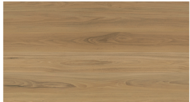
Atlantic Blackbutt 941113