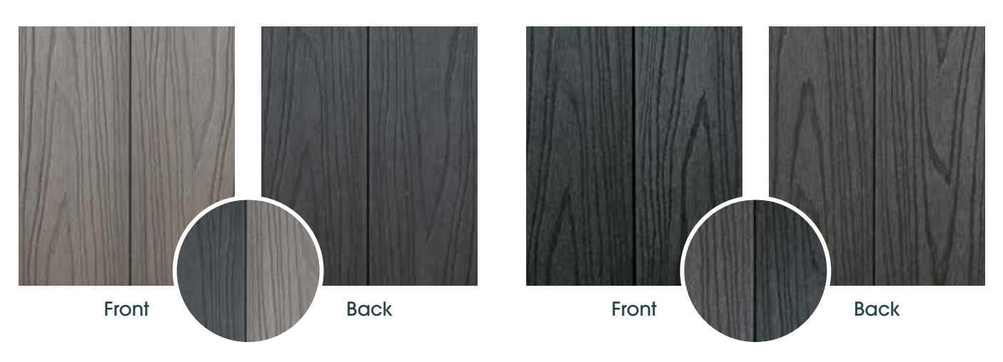
Spotted Gum & Walnut