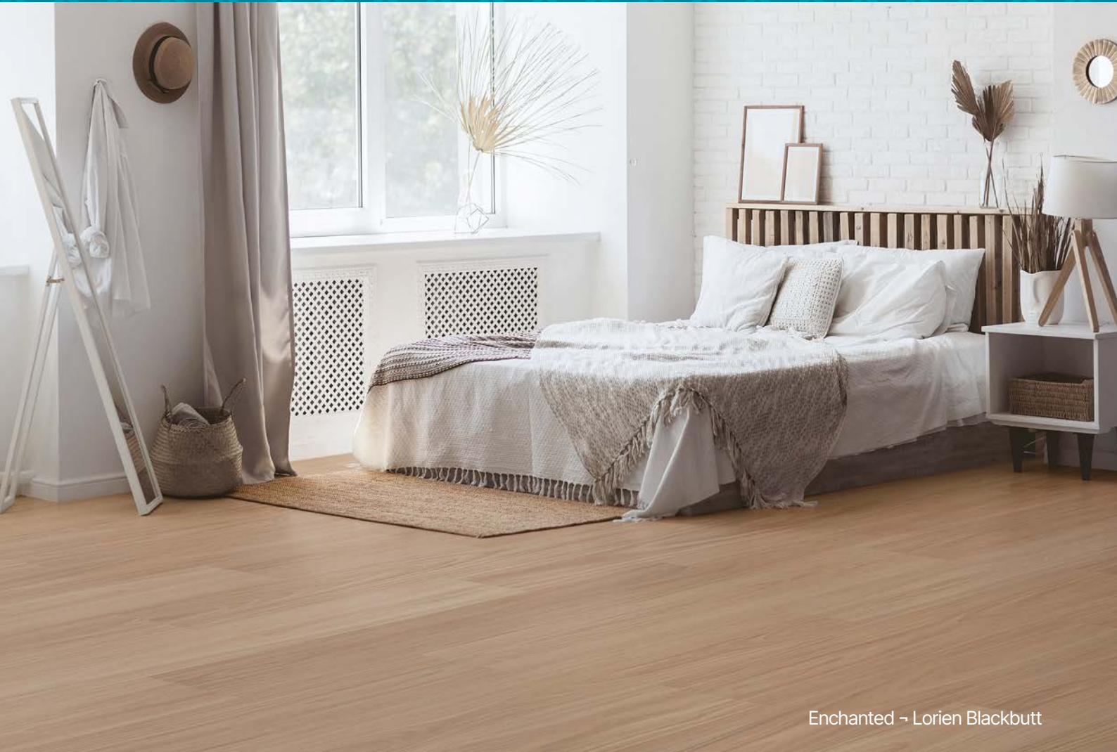
Enchanted - Lorien Blackbutt