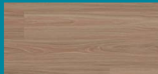
Hylia Blackbutt 887B03